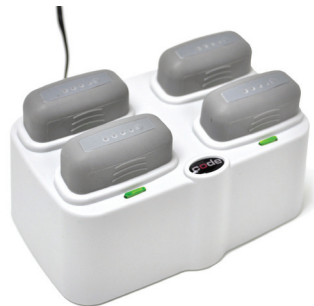
Separate charging station for continuous workflow management

Code cabled readers require extremely low power consumption, thus limiting the battery drain on mobile devices, kiosks, and POS system, reducing overall costs when deployed throughout an operation. Code wireless barcode readers have replaceable battery cartridges that are long-life, allowing readers to be used for more than a complete shift at the highest use rate.