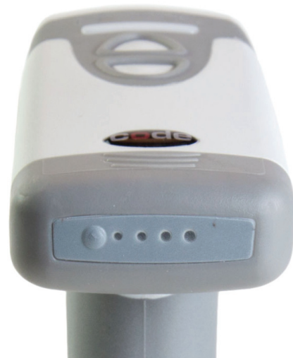
50,000 Scans per full charge.