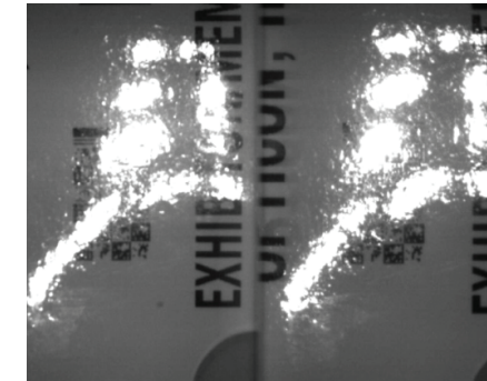
What a competitor's imager will see.