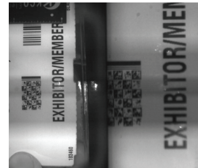
What a code imager will see.