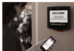
MK500 Micro Kiosk Ideal for basic customer self-service options, such as a price check and basic advertising