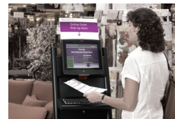
MK4000 Micro Kiosk Ideal for very robust applications in any industry