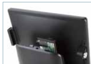
HDD easy to swap