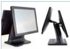
15" 2 nd display supported