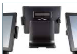
Slim type peripherals, MSR, VFD, iButton