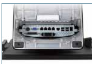
Main board removable for easy service