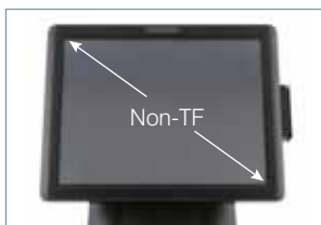
15" LED LCD display with or normal resistive technology