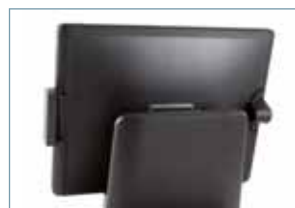
A fan-less design to reduce noise and prevent dust inside the unit