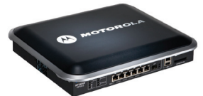
RFS 4011 available only with WiNG 5.

RFS-4011-11110-WR: RFS 4000 Services Controller with Integrated Dual Radio Access Point for Worldwide (excluding US)